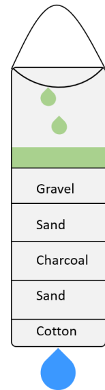
Figure 2: Illustration of prototype

Each material being used in the filter has unique and important abilities towards filtration of the water. The gravel and sand are being used for filtering away protozoans, several bacteria, and E. coli. 1 The activated carbon is used for filtering particular and potentially harmful chemicals from the water as well as odors or tastes like hydrogen sulfide. 2 The reason for using the GAC-A is that it is the one achieving the lowest TSS-score 3 and thereby the best for this use. 4 The cotton layer is however mostly for keeping the other parts from falling out. In general, the reason for the different materials in the filter is that they are easily replaceable and filter the water for bigger and dirtier particles. Therefore, it is also important to stress that it is not going to be drinking water, but water that can be used for washing cloth and water plant.