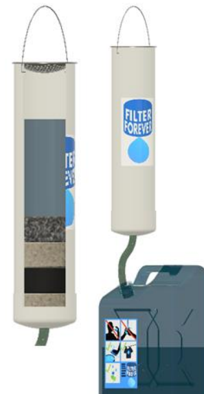
Figure 4: Filter Forever filtration system and labeled jerrycan.

A poster or board can be placed on the kiosk which contains lots of information about water hygiene and water recycling, also in text. This serves as an "advertisement" for recycling.