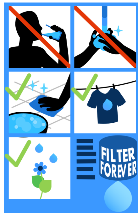
Figure 5: Educational sticker placed on jerrycans with recycled water.