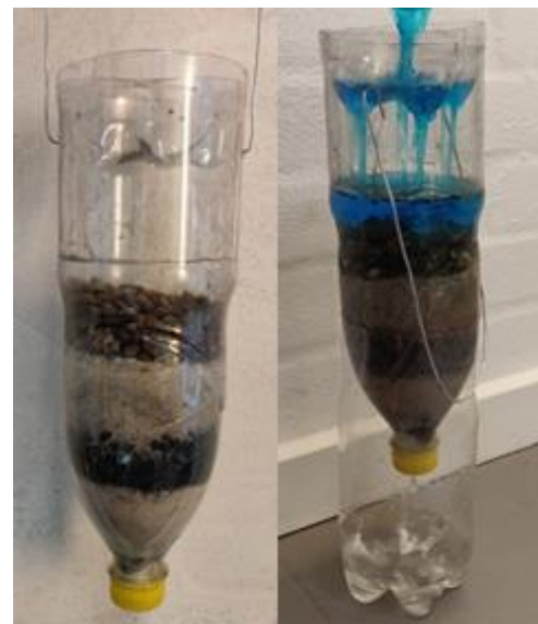
Figure 3: The filter before and after filtration of water

There is a disclaimer for this prototype and that if we used normal charcoal and not activated charcoal. The big difference between these two are that activated charcoal can absorb a lot more bacteria and have a longer lifetime, because the activated charcoal has a much higher absorbency.